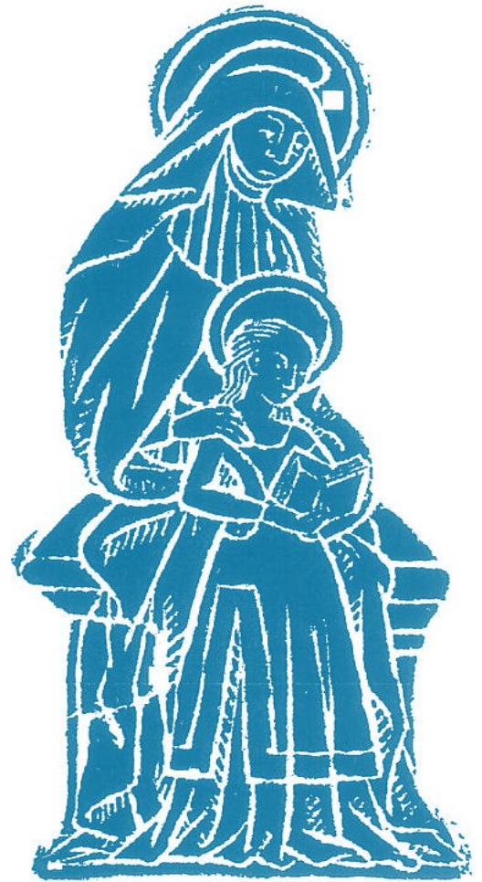
Memorial brass of St Anne at Morley, 1470