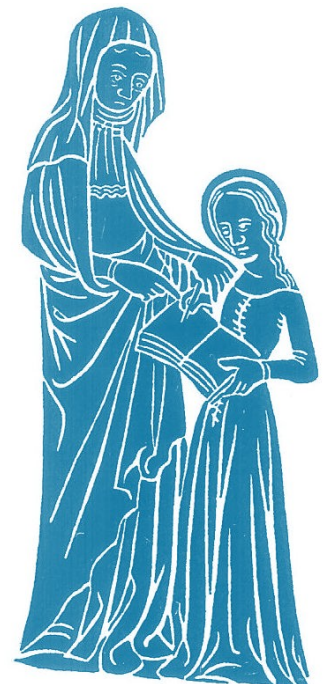
Memorial brass of St Anne at Deerhurst, c.1400