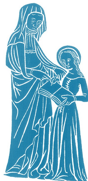
Memorial brass of St Anne at Deerhurst, c.1400